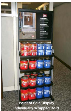
Point of Sale Display Individually Wrapped Rolls

Moisture Wrap membrane should not be left exposed for more than 30 days. For applications requiring longer exposure, use Flash N Wrap