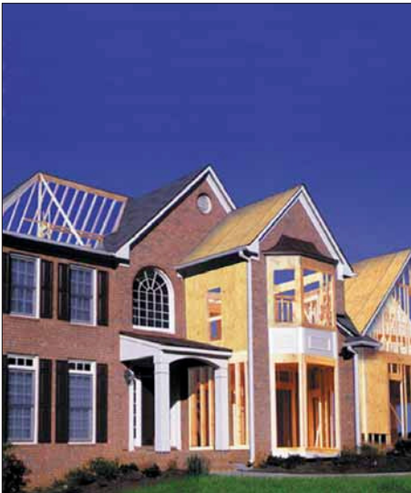
Built-in Advance Guard® protection