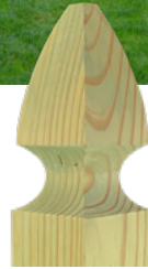
FRENCH GOTHIC REGULAR