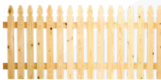
42''x48''x8' FRENCH GOTHIC SPACED PICKET