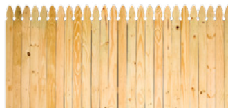
6'x8' FRENCH GOTHIC