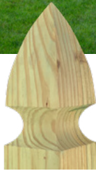
FRENCH GOTHIC POINTED