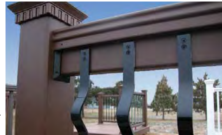
Armadillo's super-tough composite railing system accommodates glass, wrought and traditional balusters from Deckorator, Fortress and many others.

In addition to deck boards in 12, 16 and 20 foot lengths, Armadillo's super tough finish is also available on coordinating railings and post sleeves. Ask your dealer for details on color and style availability.